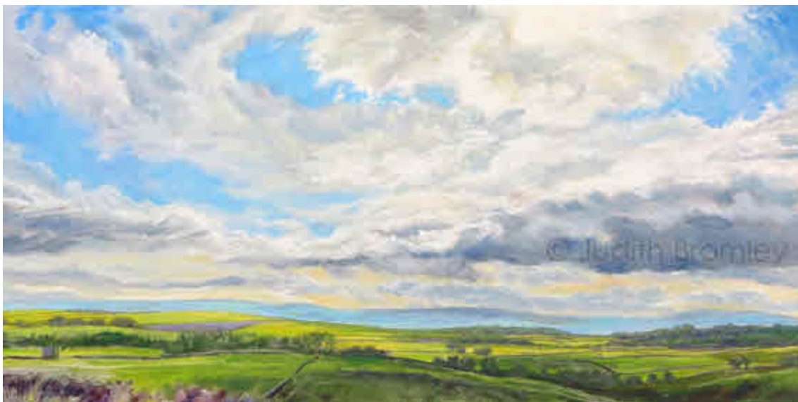
CHANGING LIGHT, SWIRLING WINDS Towards Bellerby