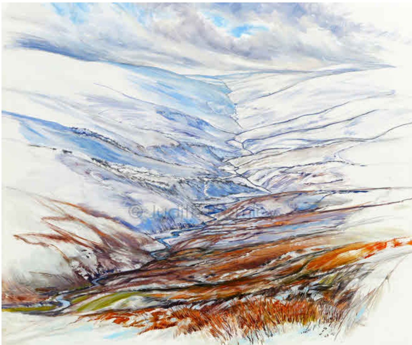
UP TO THE WATERSHED