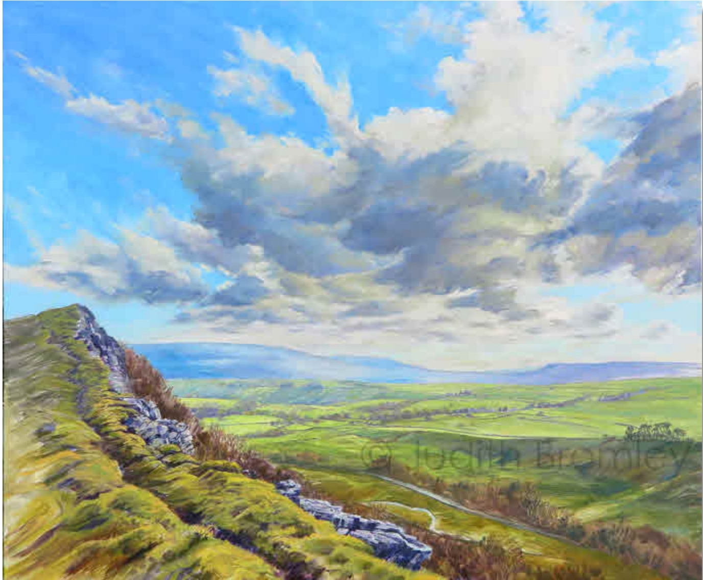
JUST BLOWING OVER?