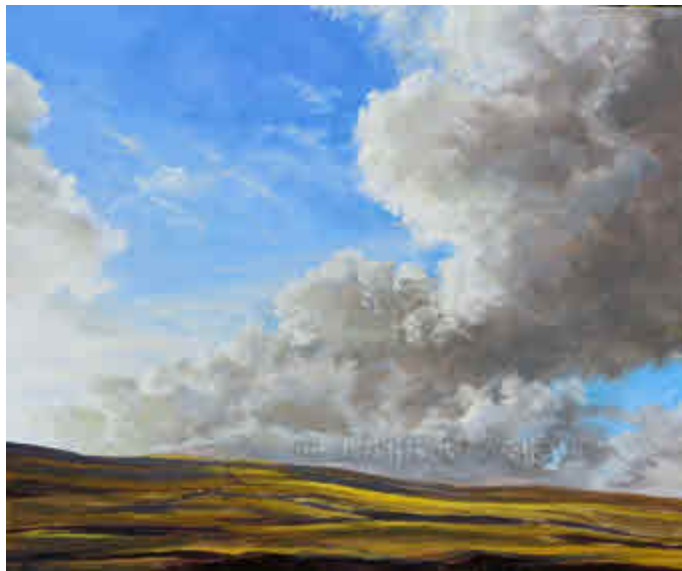
BUILDING UP AND TOWERING High on the moor