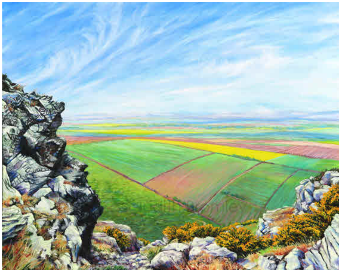
GORSE AND RAPE North Berwick Law