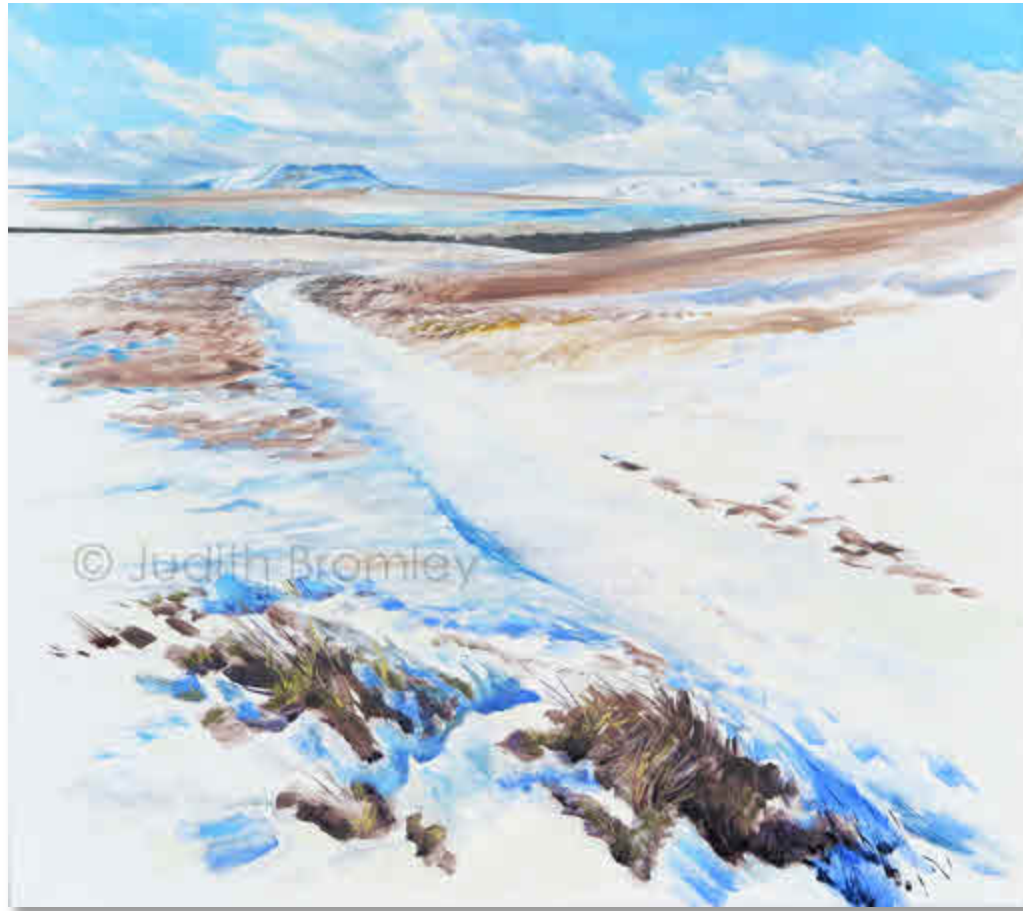
CRISP WALKING THIS MORNING