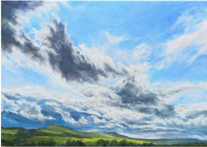
CHASING ACROSS THE DALE Over The Crag