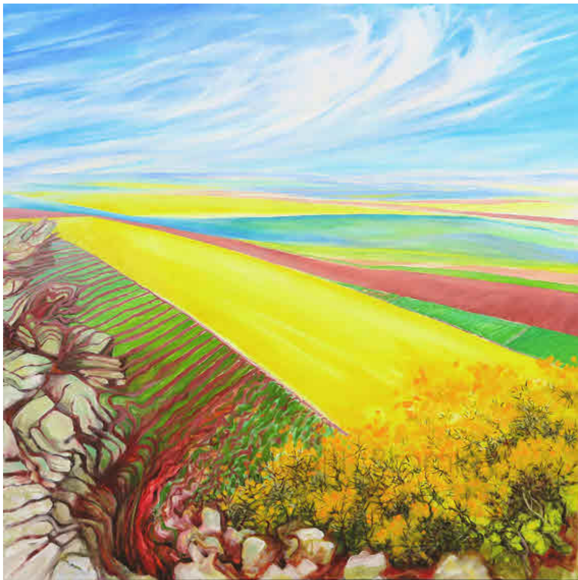
ROCK, RAPE AND RED SOIL Volcanic Fertility - East Lothian