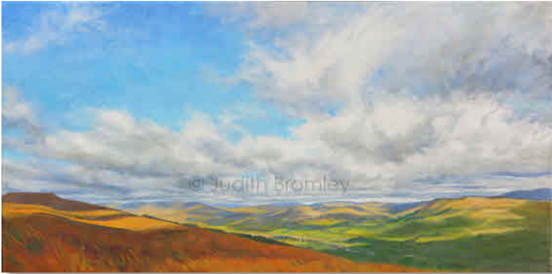
SHADOWS FLOW OVER Weatherfell to Cumbria 100 x 50 x 4.5 cm £1500