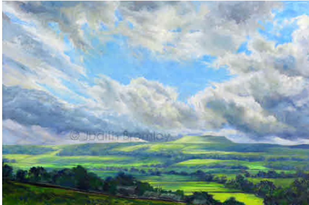
BLUSTERING Askrigg & Addlebrough