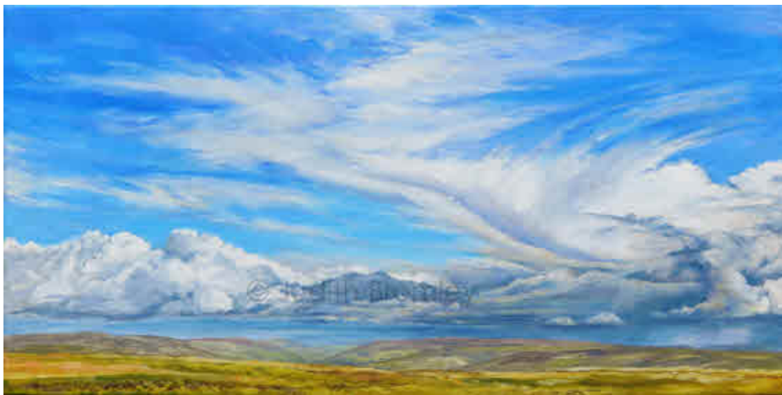
SURGING UP... Looking south from Buttertubs