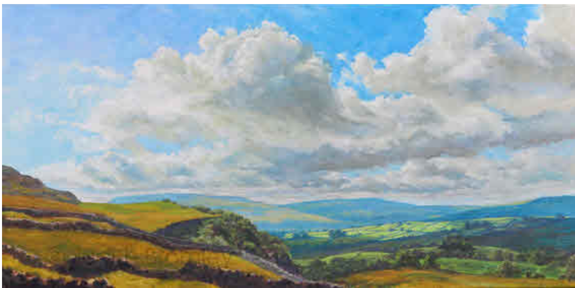
FAIR WEATHER Oxclose, Haw Bank and Ladyhill