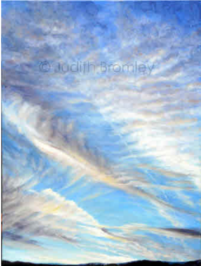
JULY EVENING SKY