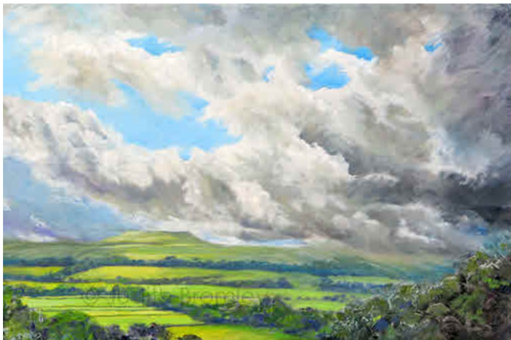
HERE IT COMES Askrigg & Addlebrough