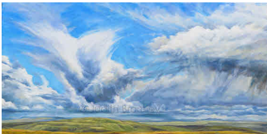
...AND BURSTING OUT Looking south from Buttertubs